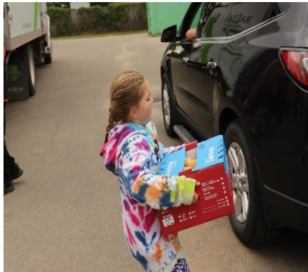
Dedicated Peach Sale Volunteers!